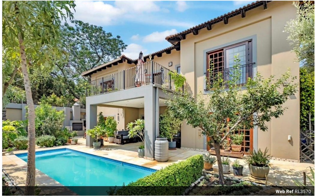
Web Ref RL3570

5 Somerset Office Park 5 Libertas Road Bryanston 2021